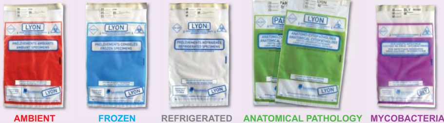
AMBIENT FROZEN REFRIGERATED ANATOMICAL PATHOLOGY MYCOBACTERIA